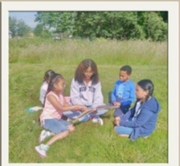
COMPREHENSIVE ACADEMIC SUPPORT