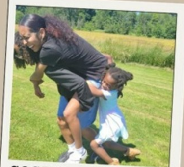
SOCIAL EMOTIONAL LEARNING