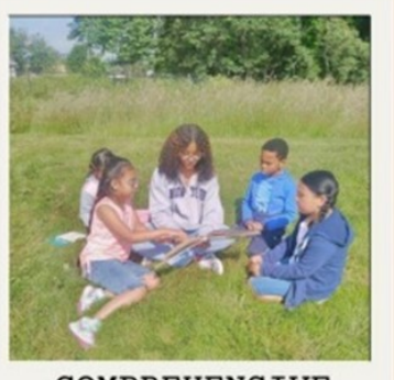
SOCIAL EMOTIONAL LEARNING