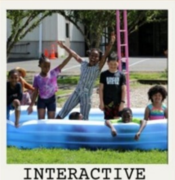
NTERACTIVE COMPREHENSIVE GAMES ACADEMIC SUPPORT