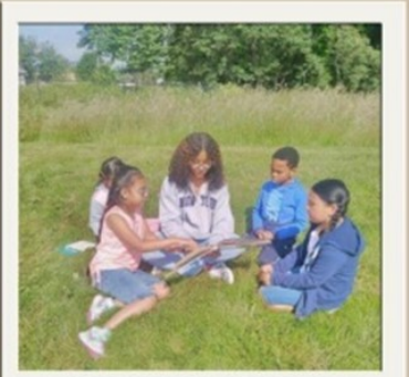
COMPREHENSIVE ACADEMIC SUPPORT