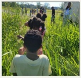
NATURE WALKS & PLANTING